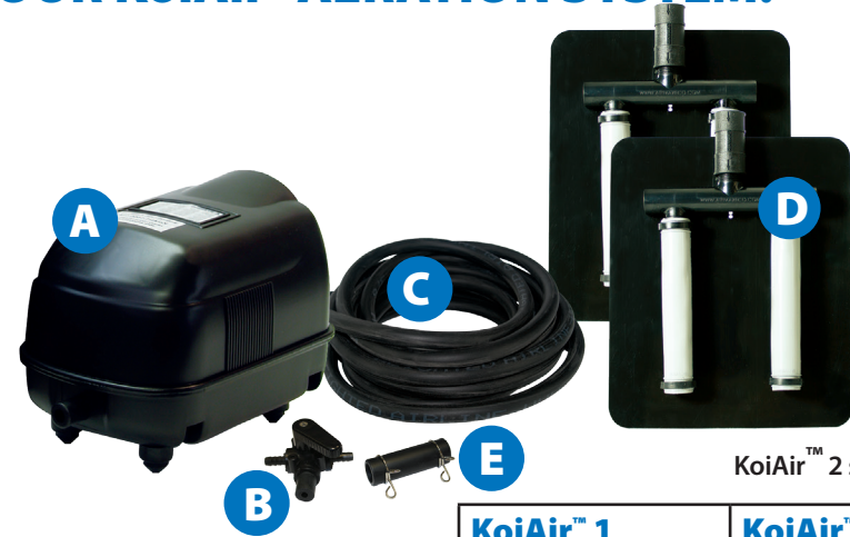
KoiAir™ 2 shown above.